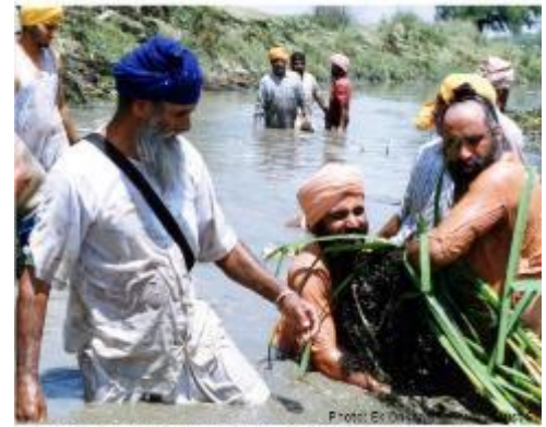
Faith Based Action Towards a Pollution Free Planet: Catalogue

The Interfaith Working Group on Pollution enables interfaith engagement to address the pollution and waste crisis. Through moral and ethical perspectives, faith-based organisations encourage sustainable practices and values-based environmental advocacy, captured under our work on Faith and Pollution Action .